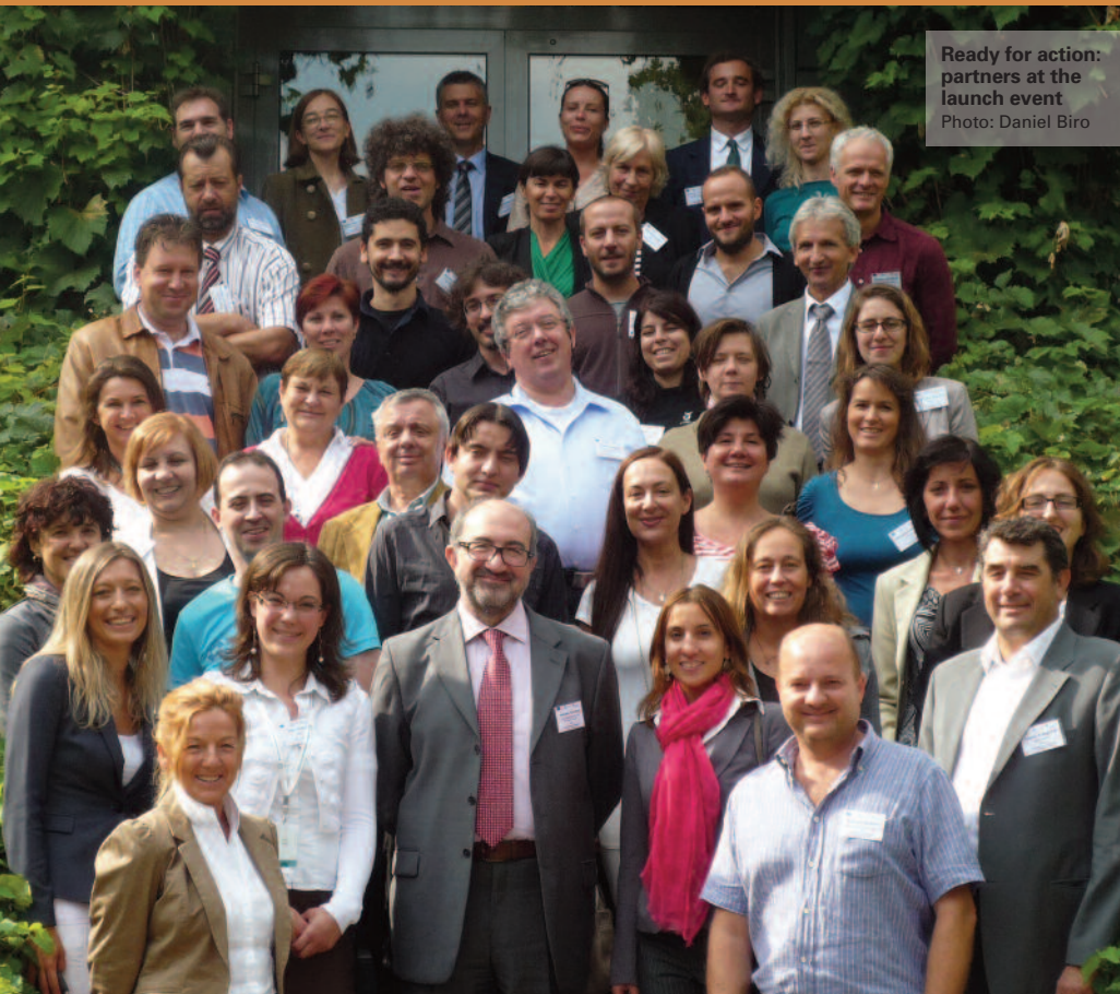
Ready for action: partners at the launch event