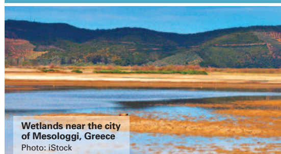
Wetlands near the city of Mesologgi, Greece

Publisher: The Regional Environmental Center for Central and Eastern Europe