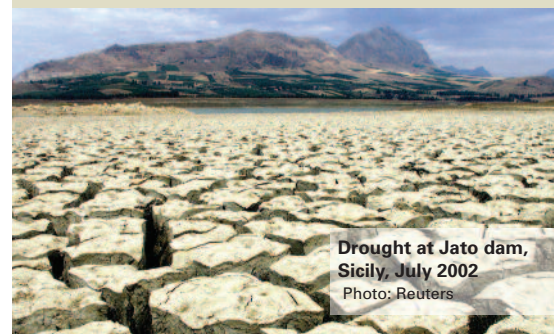
Drought at Jato dam, Sicily, July 2002

The main outputs will be six pilot studies of specific climate adaptation assessment activities developed by three thematic centres; a data platform linked to the EU Clearinghouse on Climate Adaptation; capacity-building seminars and workshops; and a working partnership among hydrometeorological services in SEE. The web-based network ensures the accessibility of all project data, documentation, discussions and guidelines not only to project partners but also to SEE territories not directly involved in the project. ●