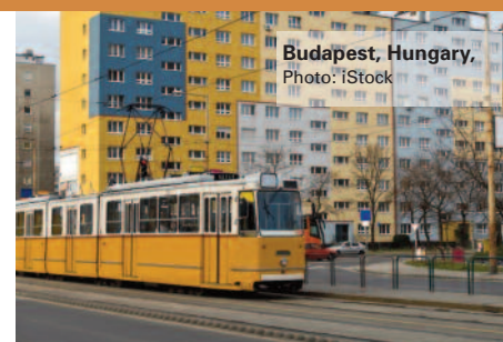
Budapest, Hungary, Photo: iStock