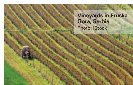
Vineyards in Fruska Gora, Serbia