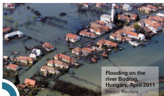
Flooding on the river Bodrog, Hungary, April 2011

Vulnerability assessment The identification of who and what is exposed and sensitive to climate changes, taking into consideration factors that make human beings or the environment susceptible to harm.