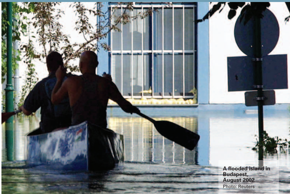
A flooded island in Budapest, August 2002

However, this knowledge often does not reach stakeholders quickly enough or in sufficient quantities. Climate change adaptation in SEE is hindered by fragmented and uncoordinated data services, patchy risk assessment procedures, and the low uptake of available knowledge in climate-sensitive sectors. There is an urgent need to overcome barriers to