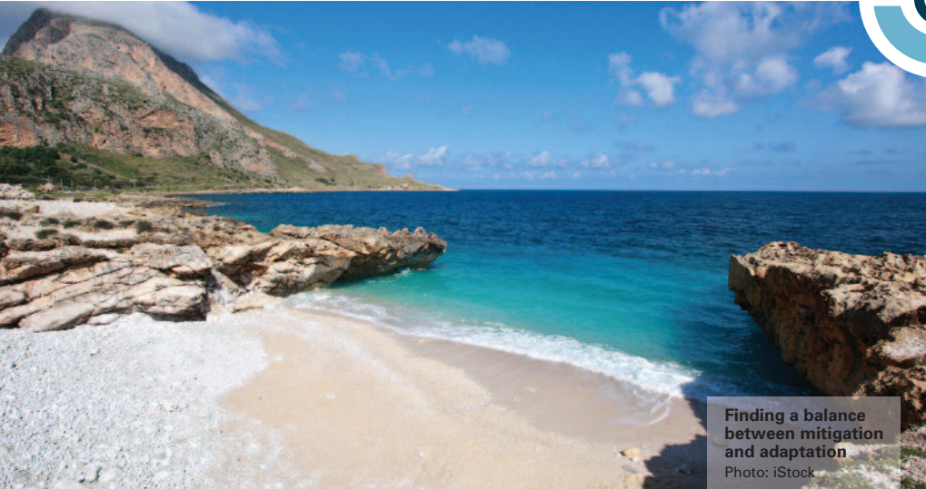
Finding a balance between mitigation and adaptation